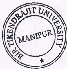
Dean Research, B.T.U